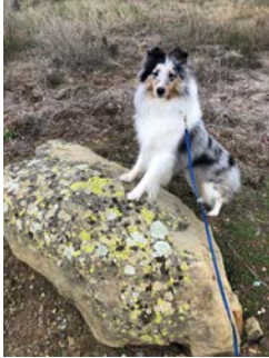
Reena's dogs Lacie doing a paws up, and Jamie in a box

Bring $$ to buy your pre ordered sandwich